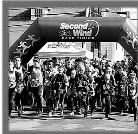
5K Race Starts at 10am