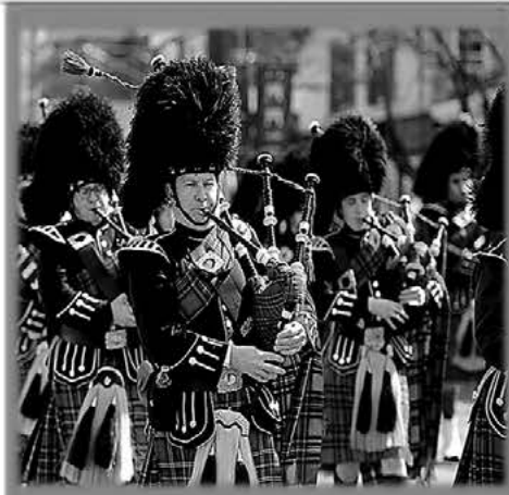
The Parade Starts at 1pm