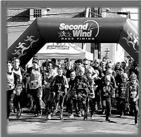
5K Race Starts at 10am