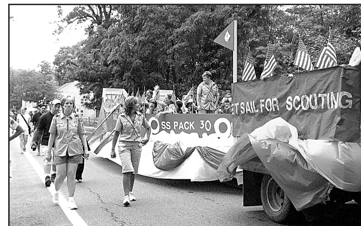
Cub Scout Pack 30