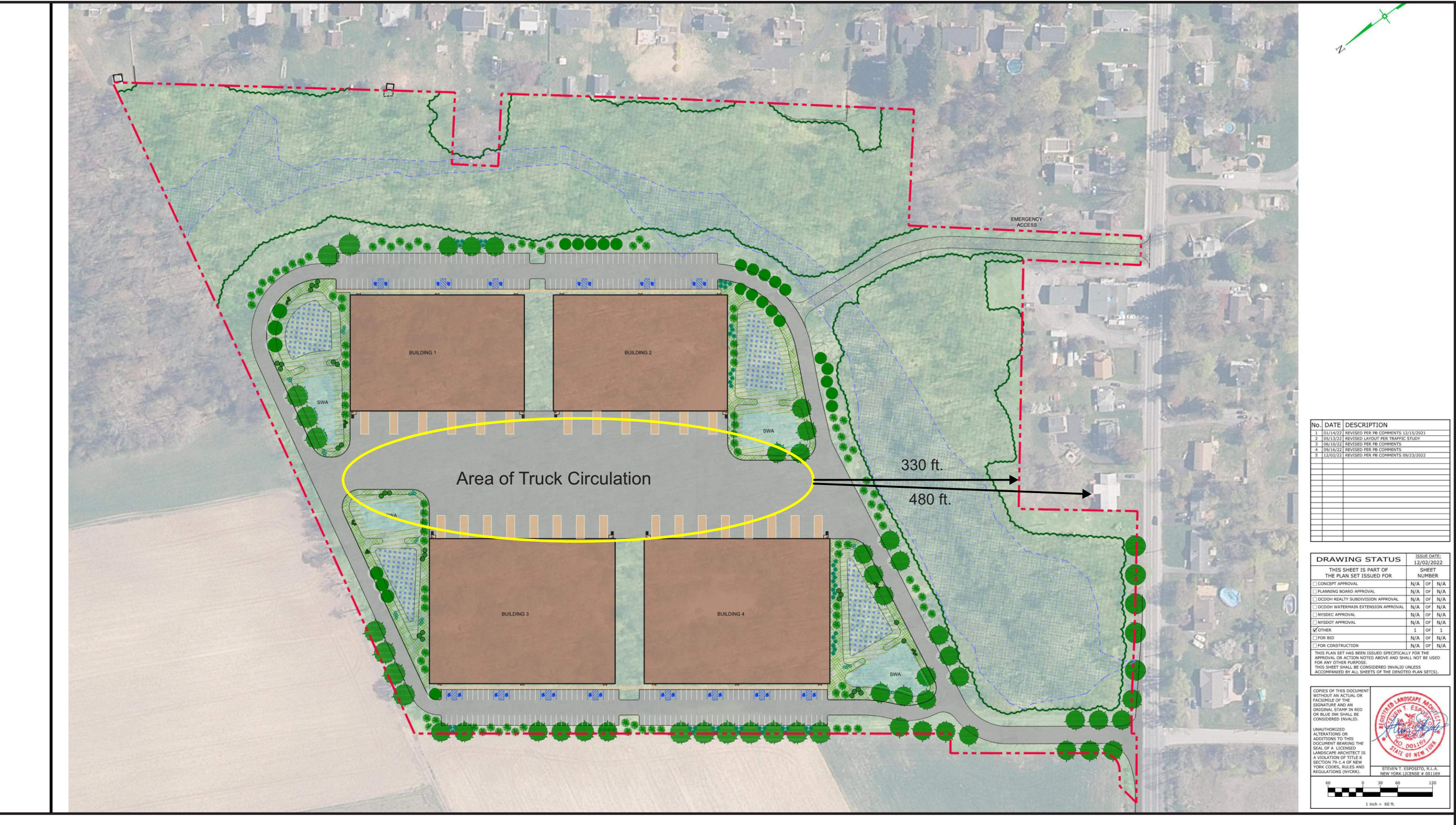
Figure 2: Site Layout KSH Route 211 Development Village of Montgomery, New York